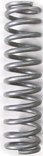
Front Spring (2ea) SPRPFRZRPRO-PS-HT