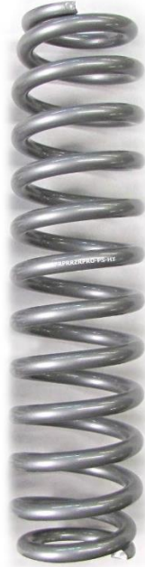
Rear Spring (2ea) SPRPRRZRPRO-PS-HT